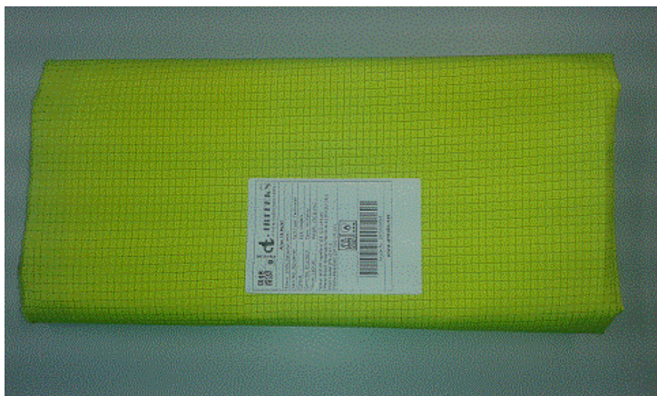
request 9772-2017 sample 16261-2017

The sampe our ref. 16261/2017 is according EN 1149-5:2008 in electrostatic properties: measurement of charge decay (EN 1149-3:2004) and is according EN ISO 13688:2013 in dimensional stability to domestic washing and drying (after 5 cycles of 6N (60°C) Tumble dry), aromatic amines derived from azocolorants and pH of aqueous extract.